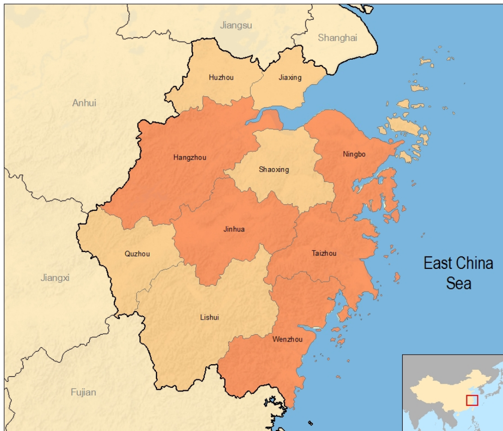
Figure 3. Farmland Quota Transfer in Zhejiang, 2001